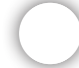
Frozen White Solid body colour