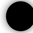
Agate Black Metallic body colour